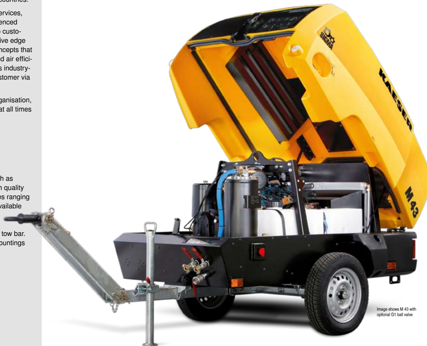
Image shows M 43 with optional G1 ball valve